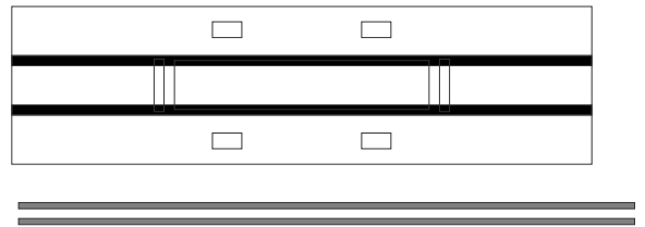
2x Schienen code 80 111mm